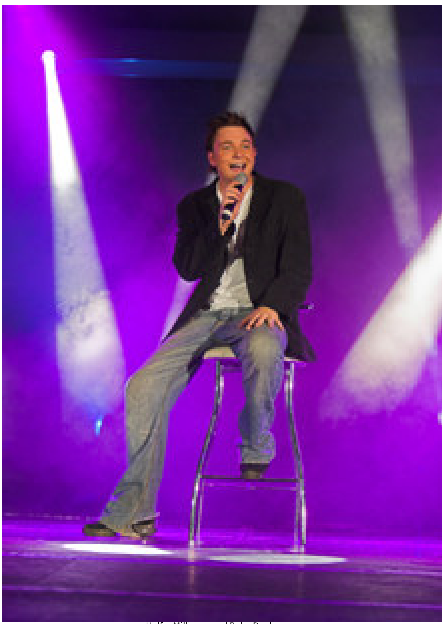
Half a Million pound Robe Deal for Butlins